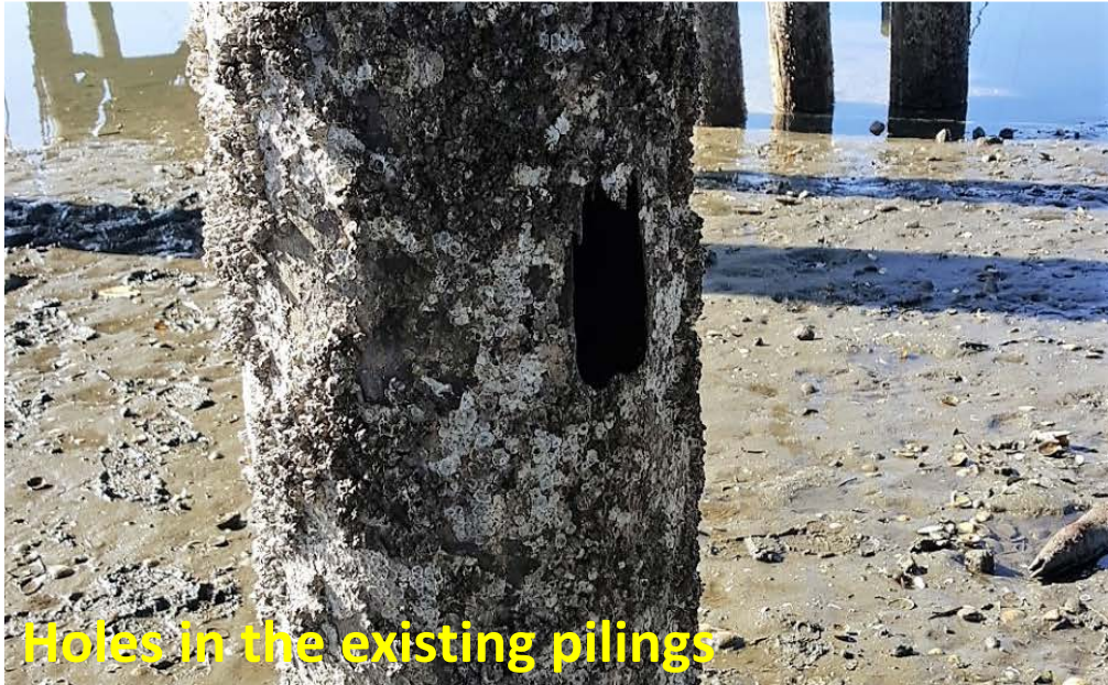
Holes in the existing pilings

600 S.E. BAY BOULEVARD NEWPORT, OREGON 97365 PHONE (541) 265-7758 FAX (541) 265-4235 www.portofnewport.com