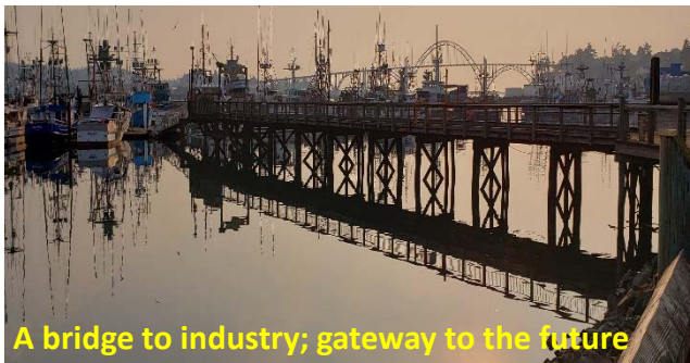
A bridge to industry; gateway to the future