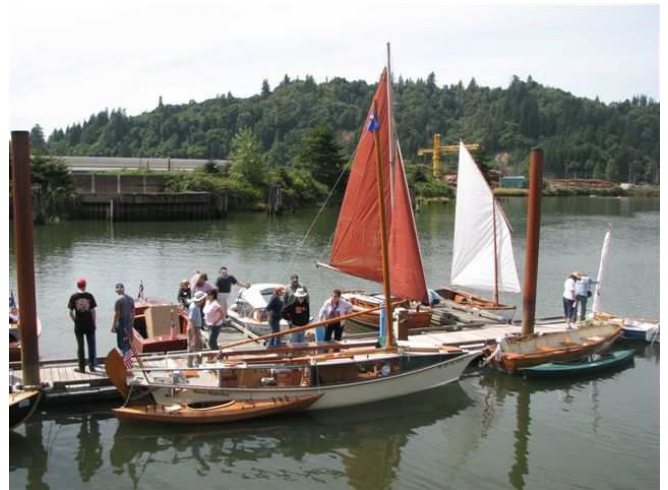
Port of Toledo Wooden Boat Show 2010

Port of Toledo 385 NW 1 st Street Toledo, OR