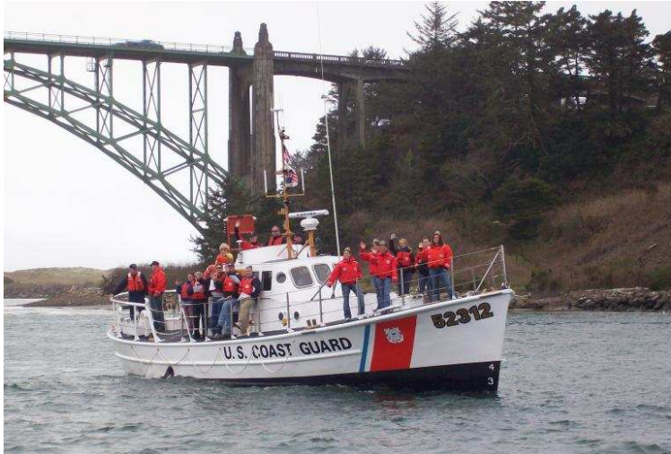
Happy 221 st Birthday to the US Coast Guard!