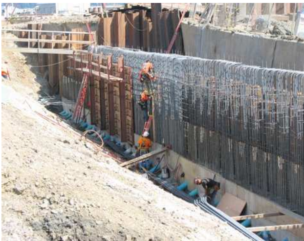
Ironworkers reinforcing the permanent bulkhead wall

The Trident Meal Plant is up and running with the Alaska fleet back in town.