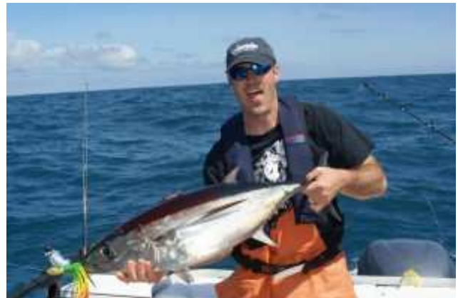
Oregon Tuna Classic 2011

There is a halibut opener scheduled for August 18-20. Call the South Beach Marina at 541-867-3321 for information or reservations.