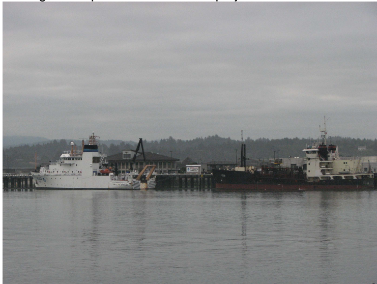
R/V Bell M. Shimada and ACOE Dredge Yaquina at the NOAA MOC-P pier

As of Thursday, July 21, Natt McDougall Company (NMC) had completed 100% of the remediation work on the SS Pasley. A bridge was built bow to bow from the Pasley to the Hennebique to bring drill rigs aboard and mount them on the Pasley's deck, to drill holes through the deck and port hull of the ship for tie back anchors. The screw anchors will go through the deck and bulkhead wall and back into the soil. The demolition plan for the Pasley has been revised. NMC will remove the forward compartment of the ship and install a bridge in that area of the cofferdam. They will then float the ship in sections and break it apart hold by hold. The concrete debris will be used to create a ramp inside the cofferdam, so the sections of the ship can be pulled up and demolished. That work will start August 15 and is scheduled for completion on or before October 8. Amendment 10 to the CM/GC contract was approved by the Port Commission in the amount of $1,889,737.77. Savings from previous amendments will go back into the construction budget but short falls remain. Commission and staff are considering all options for potential funding to complete Phase 1 of the project.